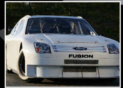
Typical Show Car